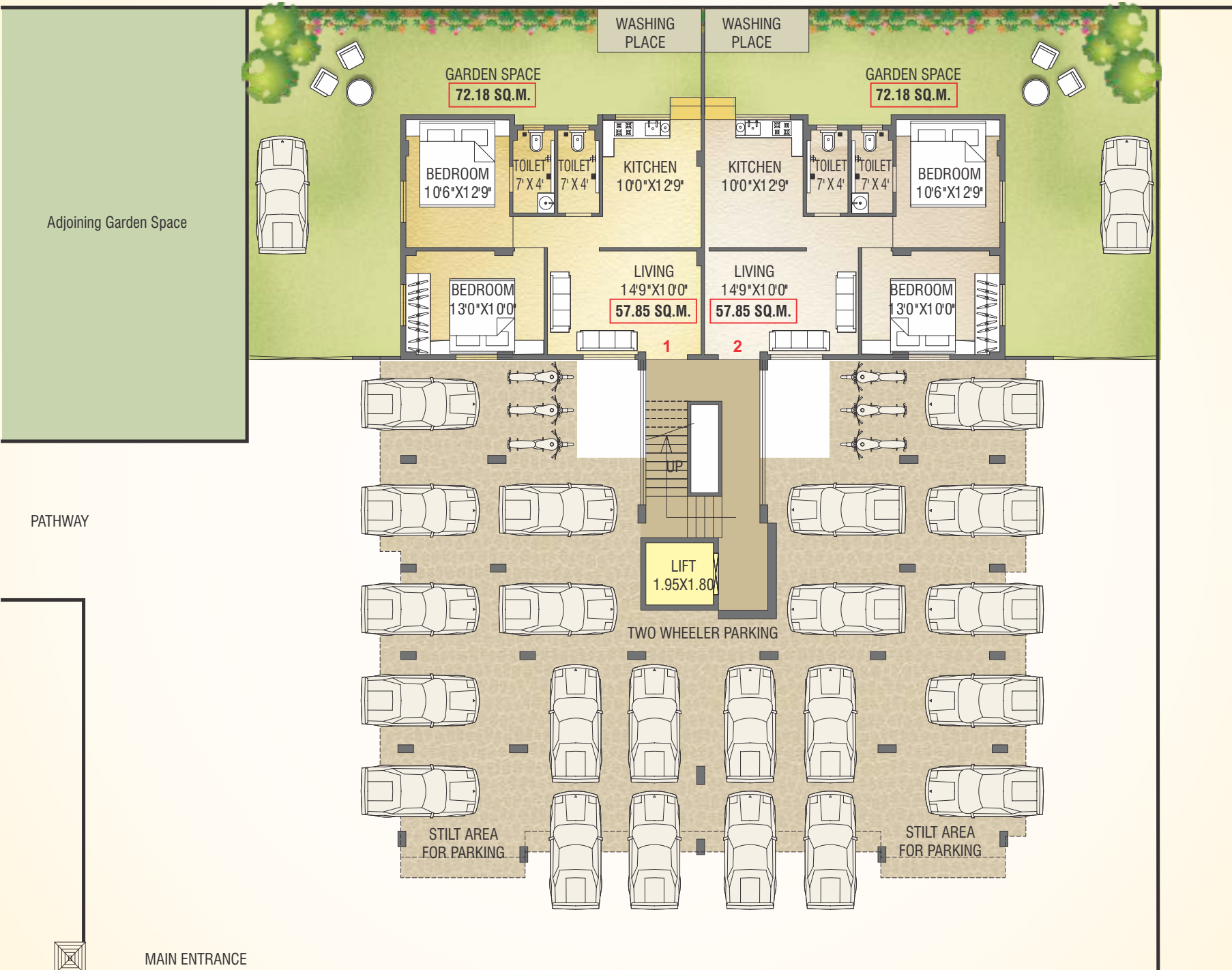
G+4, NO. OF FLATS : 26 GROUND FLOOR PLAN